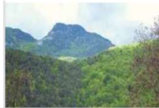
Mixed stand of oaks and pines. Teresa Baiges