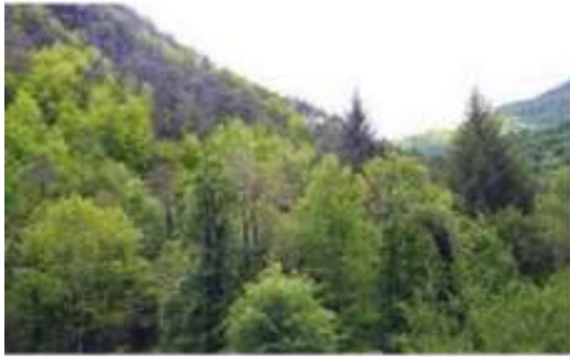
Stand of the project in Ripollès.