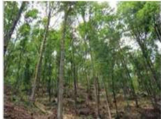
Oak forest thinning. AGS-CTFC