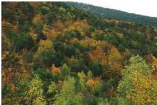
Mixed pine and oak stand. AGS-CTFC